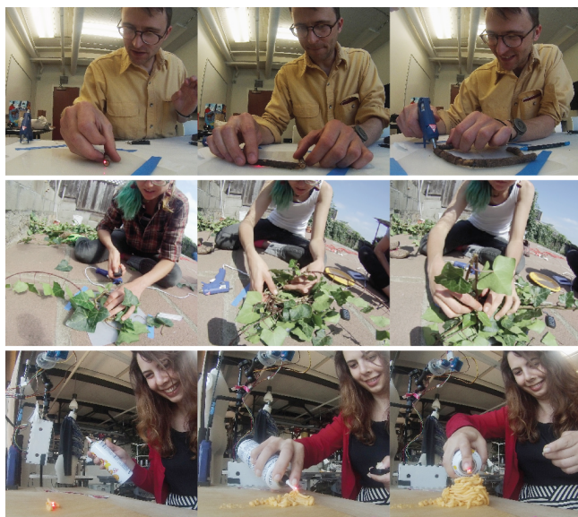
Figure 4: Participants using Being the Machine to build models from twigs, ivy, and Easy Cheese.

system to make a squirrel shaped treat for her dogs from stacks of peanut butter and bread; and Josh created a musical score for a string trio based on the model of a gun.