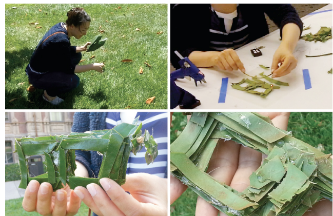
Figure 1: Being the Machine guides people in building 3D models with everyday materials. One user made a pair of glasses using found Magnolia leaves.