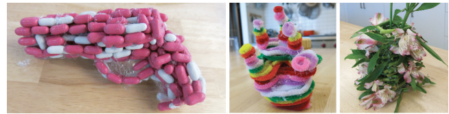
Figure 3: We showed examples of constructions produced with Being the Machine to prospective participants.

We sent email calls to local arts groups, maker spaces, and university lists. We also sent a short video to interested participants that explained how a 3D printer works and how it related to Being the Machine. The video included time-lapse videos of a researcher building three example models: a hand made of pipe cleaners, a vase made of live flowers (with additional images of the vase decaying over time), and a gun made of “Good & Plenty” candies [Figure 3]. We carefully chose this particular set of examples to invite curiosity and demonstrate the variety of materials the system could accommodate. Prior to meeting, we asked prospective participants to watch the video and send a list of materials and models that they would like to use with our system. Participants were not screened based on their responses; we simply wanted to prepare a selection of materials that might be of interest to the participants. We