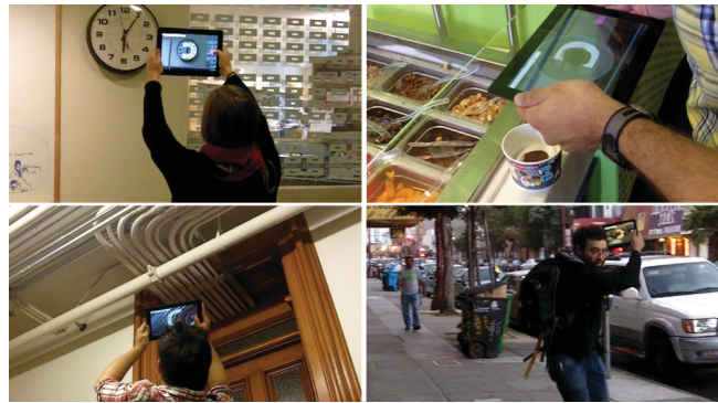
Figure 4: Study participants capturing "c" shapes from clocks, frozen yogurt, pipes, and video of movement while running down the street.

Participants imagined a number of ways they would use AnyType for communication. Using AnyType while traveling seemed like an exciting possibility for many