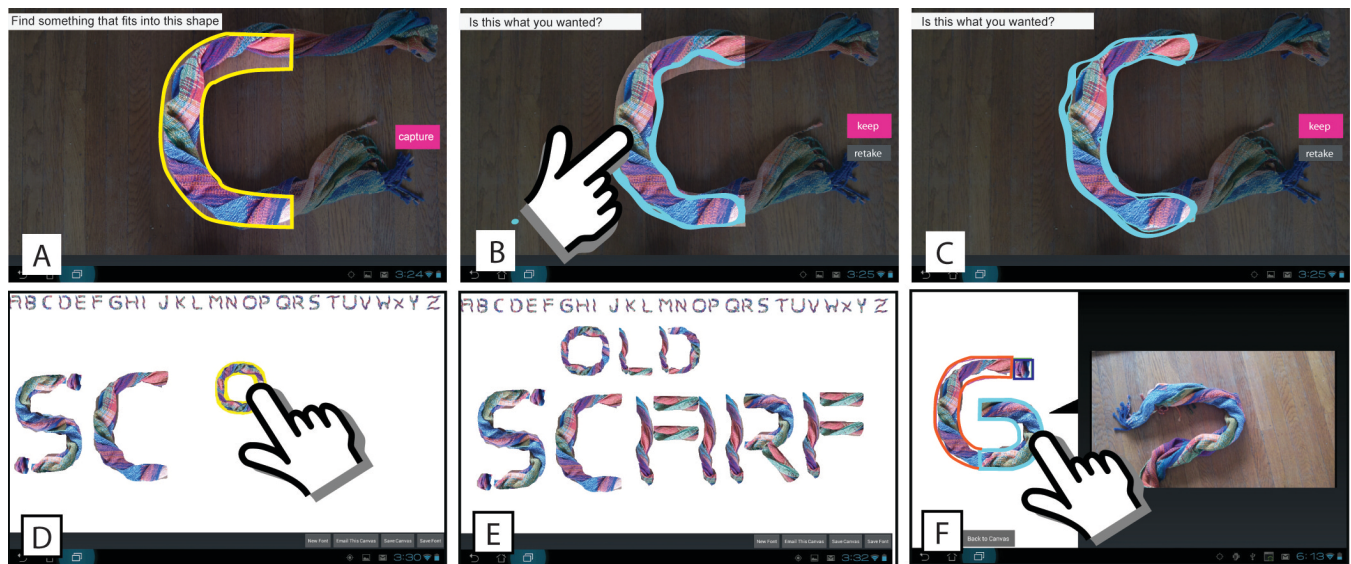
Figure 2: A) The user looks onto her environment through a shaped frame and captures (photographs) an object in this shaped frame. B&C) After capturing the shape, the user can edit by drawing a custom outline for the shape. D&E) After capturing all five shapes, the user is presented with her personal alphabet in the composition mode. The letters can be dragged, scaled and erased with fingers. F) In the history view, the user can see the original photographs that were used to compose each letterform.

When the user or recipient presses and holds one of her finished letters on the canvas, she is taken to the “history view” that shows how the different shapes were arranged to compose that letter. Clicking on one of the letter’s shapes reveals the original photo or video from the point of capture. This view is designed so that the user or recipient can access a history of how each letter was made. For instance, the user may capture a gear from a bicycle in one of the arched shapes. Without added context of the entire image of the bicycle, someone other than the creator viewing the typeface might not be able to discern