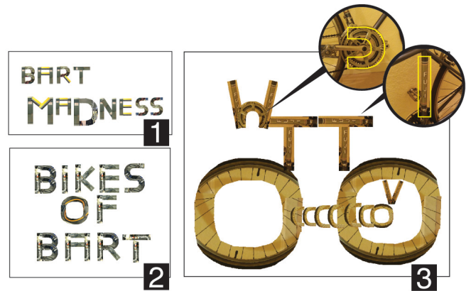
Figure 5: 1) A typeface and composition Karen made on her commute home. 2) Delight with the first composition led her to create the second typeface from the bikes of other commuters. 3) Inspired by her bike typeface from her commute, Karen created another composition of her own bike when she reached home.

As the participants brought AnyType with them on their daily journeys, they found themselves exploring the