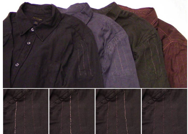
Figure 2. (top) Ripple, a shirt whose three shoulder pinstripes change color in response to skin conductance, was produced in multiple colors and sizes. (bottom, from left to right)

So, we designed Ripple to seem unauthoritative and invite critical questioning, and build on prior work. We previously studied social interpretation of thermochromic t-shirt skin conductance displays during 45-minute conversations in an office. We found the display was enrolled in self-presentation and that it might be desirable to enact social performances with biosensing displays [36]. Ripple’s design supports social performances and expands both the length and contexts of the study to form a richer picture of biosensing in participants’ daily lives. The always present yet unobtrusive display was available to participants as they experienced a range of situations and social circumstances,